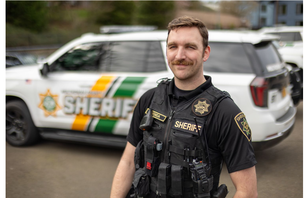
A MCSO deputy assigned to the HOPE Team

Reading the table: Troutdale Share shows the portion of countywide HOPE Team activity that occurred within the MCSO patrol area serving the City of Troutdale.