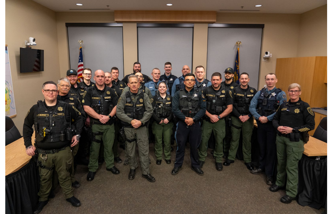
2025 Fallen Deputy DUI Memorial Mission – Troutdale, OR