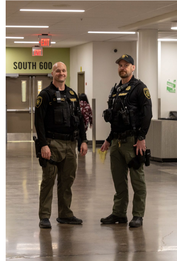
MCSO School Resource Deputies at Reynolds High School