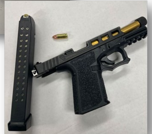
Evidence seized by MCSO